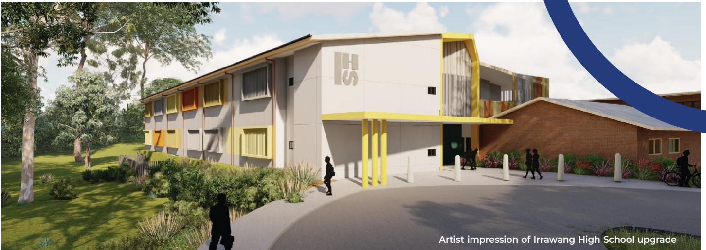
Artist impression of Irrawang High School upgrade