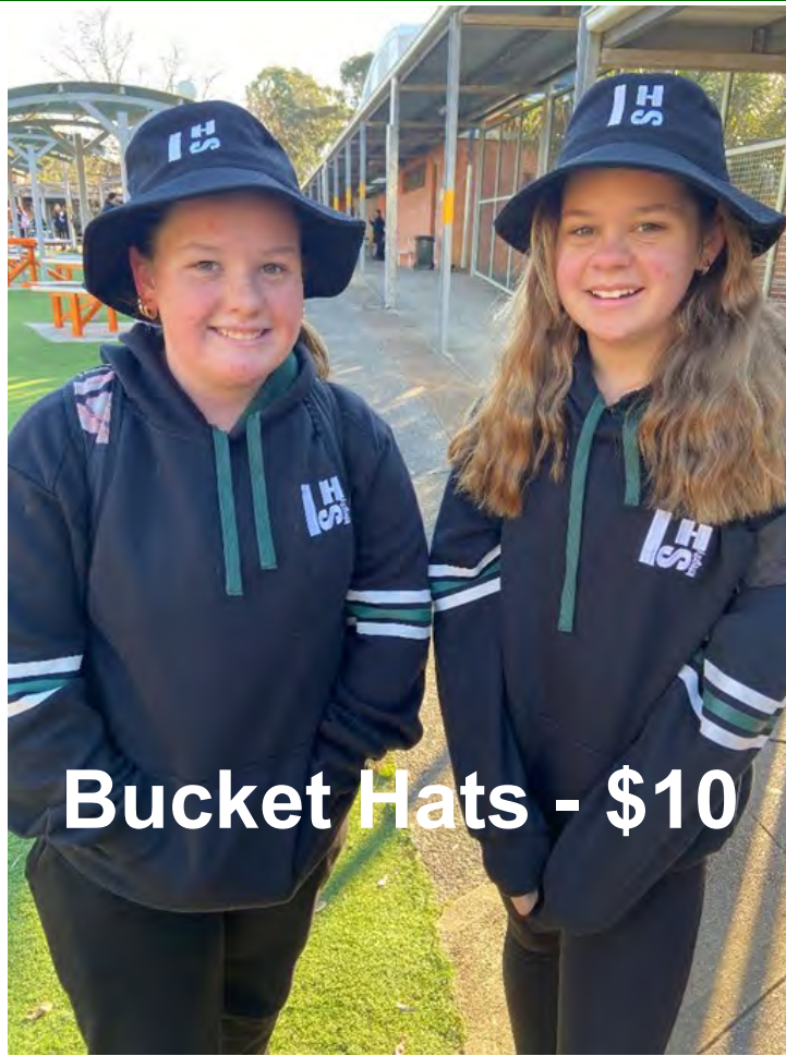
Bucket Hats - $10