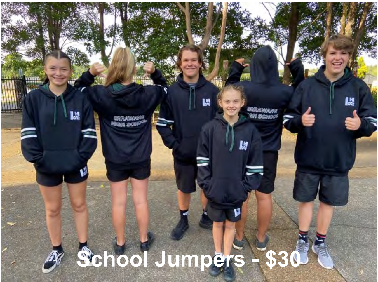
School Jumpers - $30